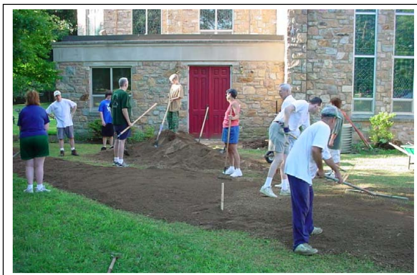
Grounds Workers moved heaven (rain runoff) & earth

Honey-do-Club. Men and women are invited to join a group who save the parish thousands of dollars each year by performing small repair and maintenance projects around the church.