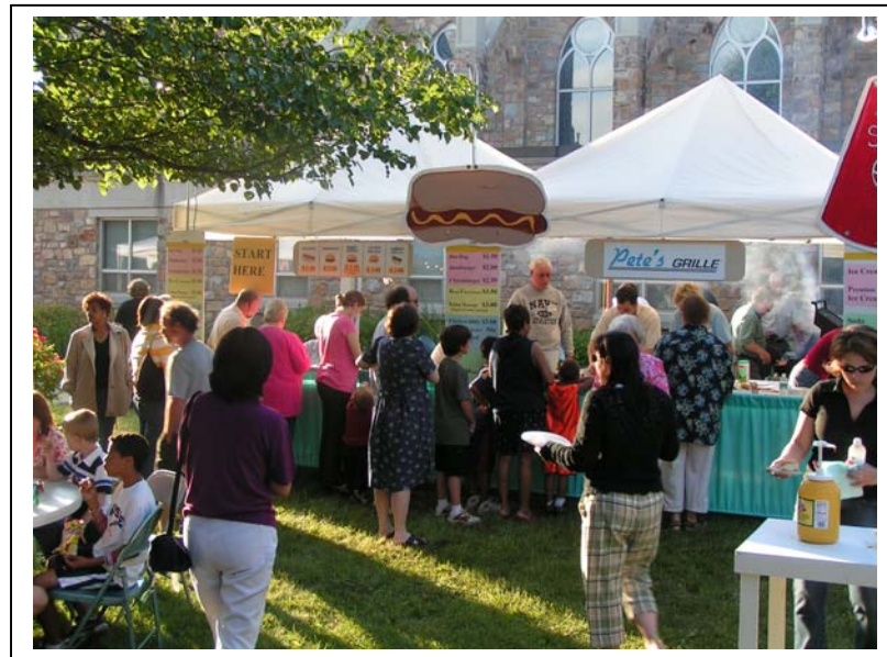
The Carnival needs many hands.

Carnival. This event is a major ministry of the parish that raises funds for outreach projects and the Sylvan Handley Fund. The past two years we have raised almost $28,000. This ministry involves all kind of skills. The areas needing your service are: set up tents/tables/chairs, tear down, food preparation, food distribution, food selling, ticket selling, security, hospitality, attendants for Parson's Porch, raffles, white elephant sale, setup for white elephant sale, and organizer of stage entertainment. In addition to raising funds it is a great opportunity to get to know other people in the congregation.